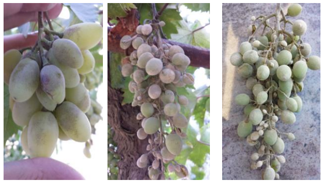
Figure 1: Infected Bunches used to perform PCR amplification.

Role of Overwintering Forms of Erysiphe necator in Epidemiology of Grapevine Powdery Mildew in Palestinian Vineyards