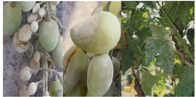
Figure 2: Infected Bunches and leaves used to perform PCR amplification.

PCR was performed directly from conidia and/or mycelium from naturally infected field samples, allowing the large scale monitoring of fungal populations: 397 samples from 8 vineyards were analyzed by the uses of the primer pairs UnE-UnF (Figure 3 and Table 2).