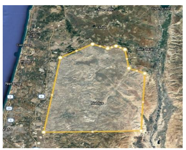
Figure (1): Targeted area of Google maps.

To measure the radiation levels ranging from 80 MHz to 2 GHz, a Portable Field Strength Meter with the suitable set of antennas was used. This frequency range covers the radiations from different sources as mobile phone base stations, local radio and television stations, mobile phones, Wireless Local Area Network, Bluetooth, wireless computer periphery and even microwave ovens. Points close to mobile phone base stations and local radio and television stations in addition to randomly selected points were included.